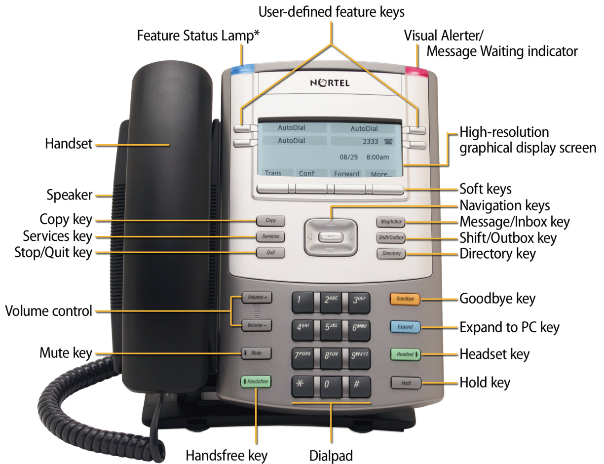
Figure 1: Physical features